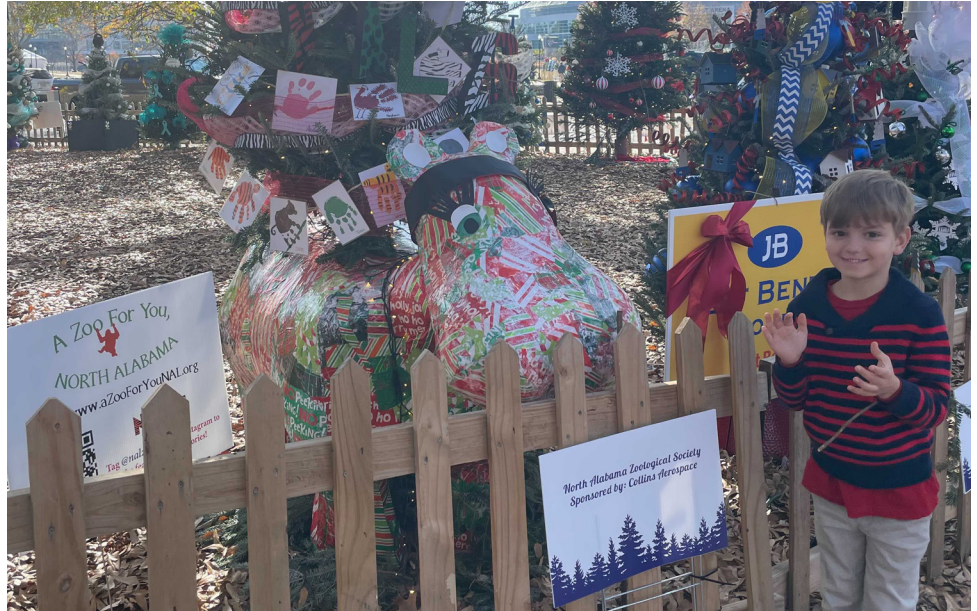
Above: NALZS' tree at the Huntsville Tinsel Trail; Below: NALZS' holiday parade float